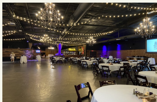
TCU RM Alumni Roundup 2023 dinner, dance, and auction