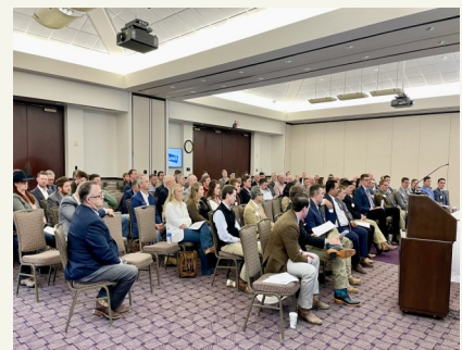
TCU RM Alumni Roundup 2023 morning session